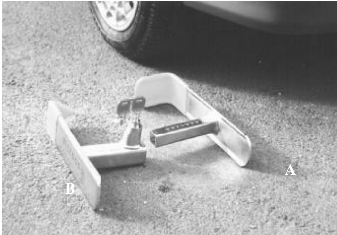
1. A - Inner Arm. B - Outer Arm.