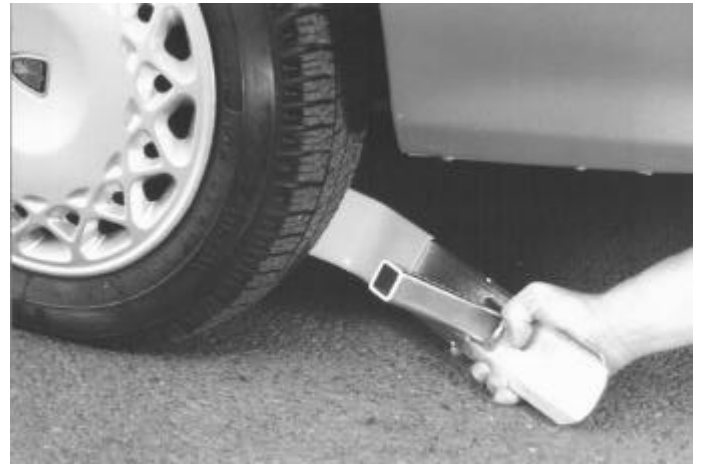
2. Position inner arm behind wheel, hook into rim.