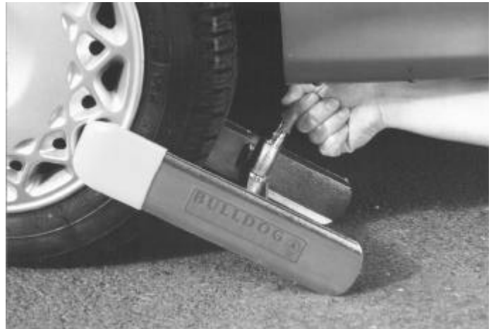
4. To remove clamp, insert key, rotate 1/2 turn, pull on key and/or press inner and outer arms together until lock pops out.

We have taken every care in the design and manufacture of this security device and we believe that it is an effective deterrent. However we cannot guarantee that it will resist the efforts of the most determined thief, and as such we do not accept any liability for loss or damage caused by theft, vandalism or other illegal activity against property to which this device is fitted.