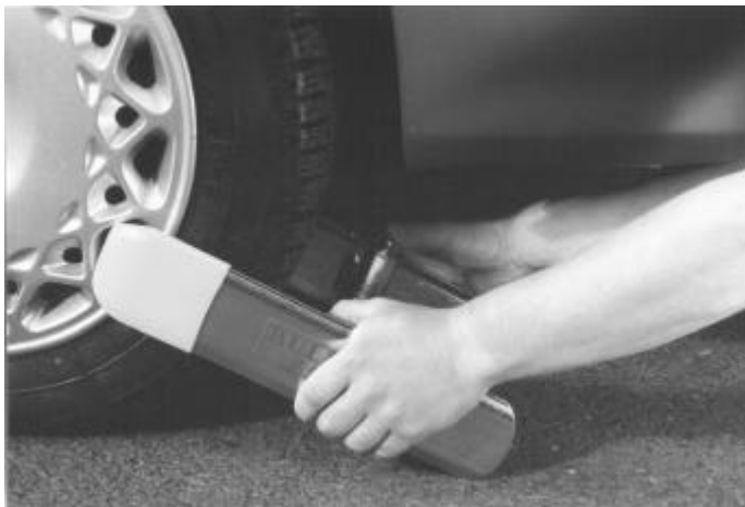
3. Slide inner and outer arms together, ensuring pointed outer arm fits into recess or hole in wheel, and push lock into nearest hole.