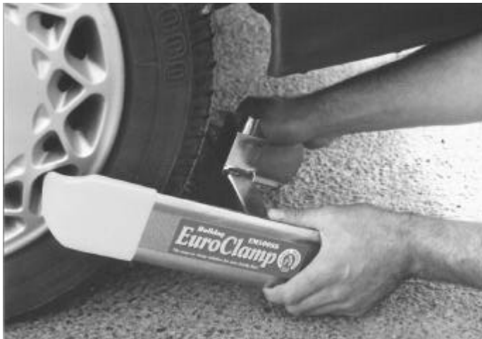
3. Slide inner and outer arms together, ensuring pointed outer arm fits into recess or hole in wheel, and push lock into nearest hole.