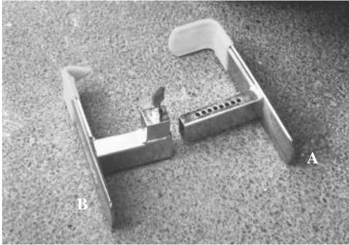
1. A - Inner Arm. B - Outer Arm.