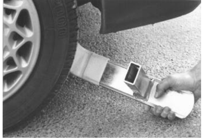
2. Position inner arm behind wheel, hook into rim.