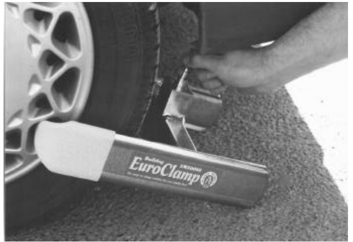
4. To remove clamp, insert key, rotate 1/2 turn, pull on key and/or press inner and outer arms together until lock pops out.

We have taken every care in the design and manufacture of this security device and we believe that it is an effective deterrent. However we cannot guarantee that it will resist the efforts of the most determined thief, and as such we do not accept any liability for loss or damage caused by theft, vandalism or other illegal activity against property to which this device is fitted.