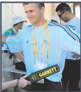
2000 Sydney Summer Olympic Games